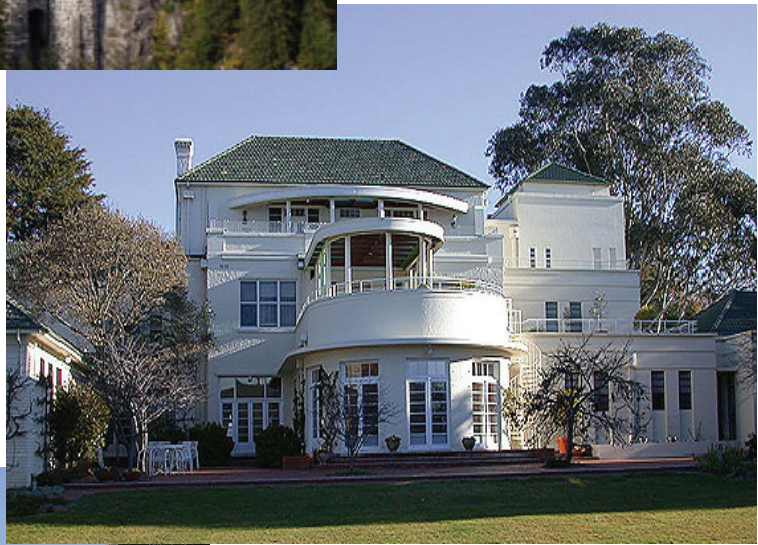
Government House Yarralumla