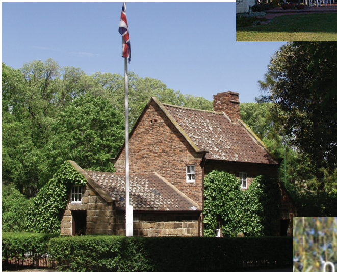
Captain Cook's Cottage