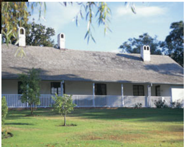
Tranby House Perth